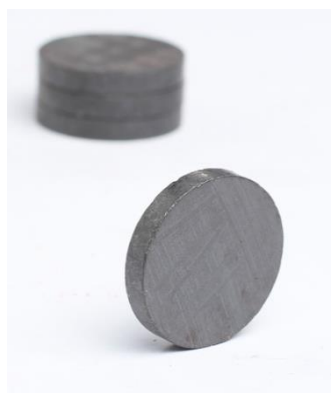
Craft Magnets for White Boards