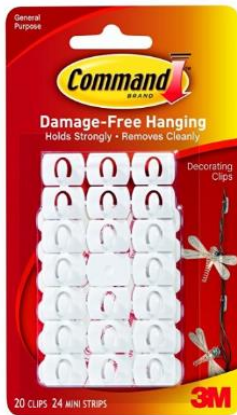
Command Small Hooks