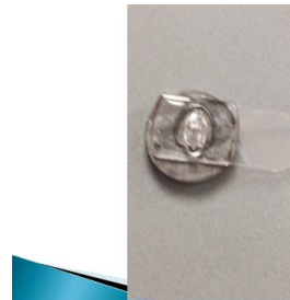
Hook Attached to Magnet